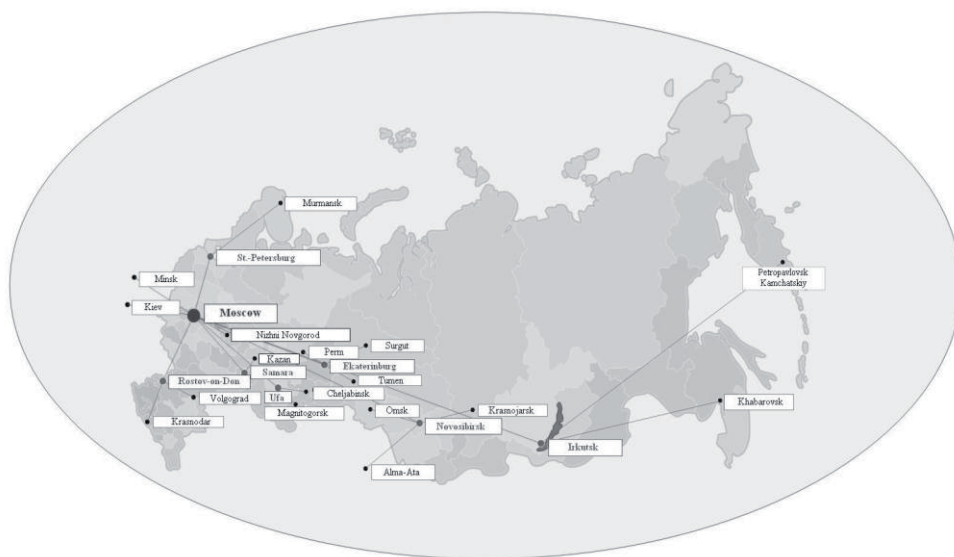
Fig. 1. The scheme of an arrangement of the basic links of the company

production enterprises (which are located in the cities of St. Petersburg and Yekaterinburg). It also provides uninterrupted operations of regional offices and regional representatives. The regional headquarters of the company are located in the largest cities of Russia and neighboring countries (fig. 1). The company has also started cooperation with the international concern BASF and the Swiss company Sika, delivering the best known brands and recent developments into the Russian market of industrial floors.